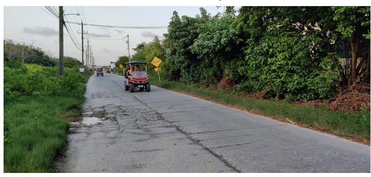
Area 15: Severity - 1