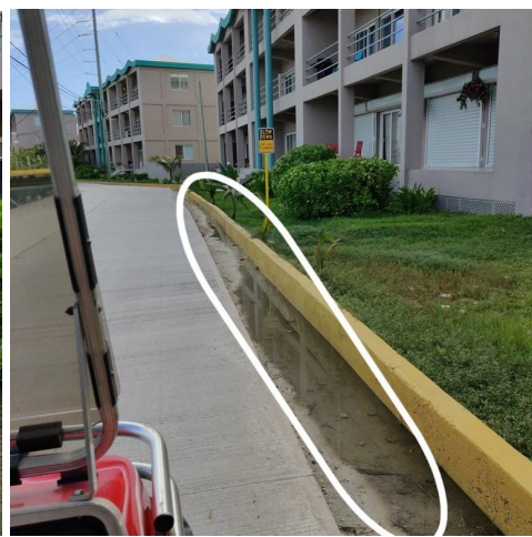
Area 3: Severity - 2