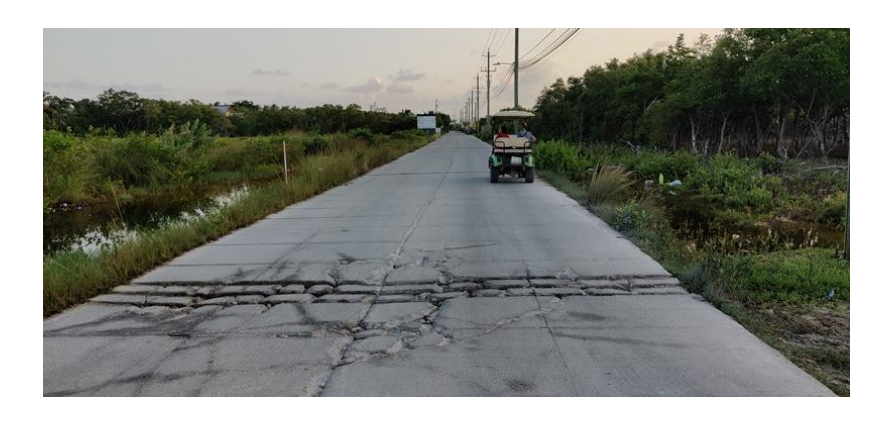
Area 17: Severity - 3