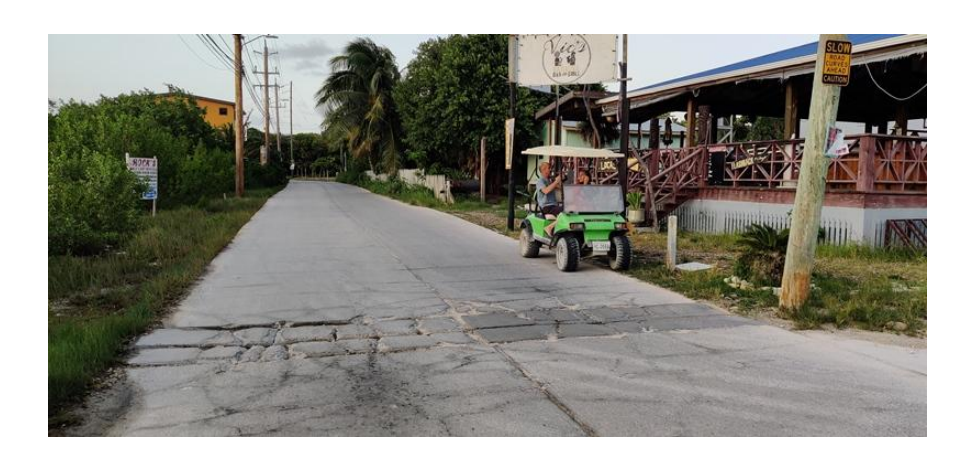
Area 11: Severity - 4

Recommendation - Full area needs restoration.