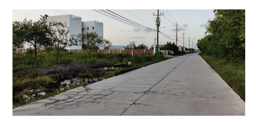
Area 13: Severity - 4