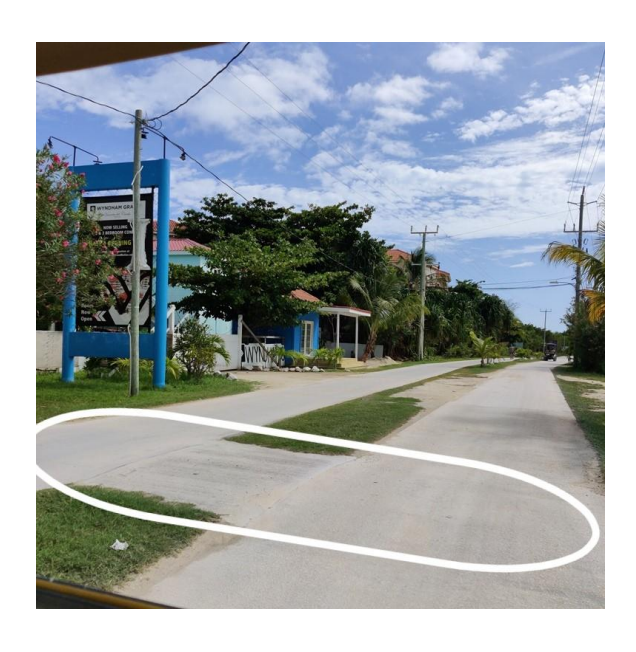
Area 19: Severity - 3

Recommendation - Needs marking and lighting as possible.