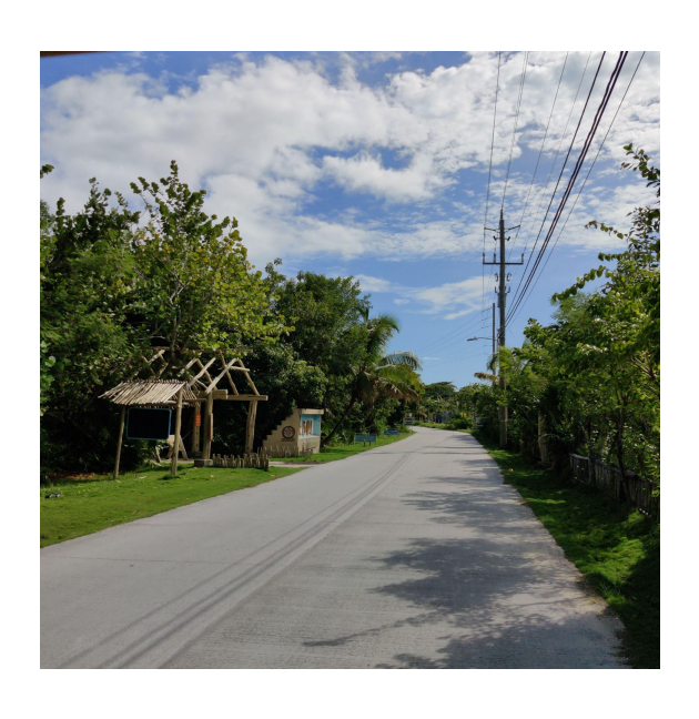
Area 9: Severity - 1 Location - Grand Caribe Problem - Better lighting and speed bump markings. Recommendation - Stain or paint and add adequate lighting.

Recommendation - Make this multi functional by adding sidewalks and a crosswalk speed bump.