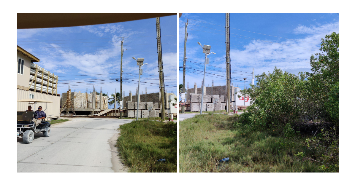
Area 5: Severity - 3

Recommendation - Vegetation trim 10 foot minimum inside corner west side of the road, should be more.